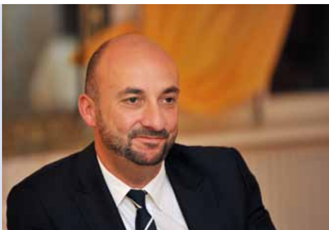
Mr. Etienne Schneider, Minister for the Economy and Foreign Trade