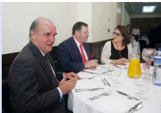
On the left, Mr. Manuel Pinto de Abreu, Portuguese Secretary of State of the Sea